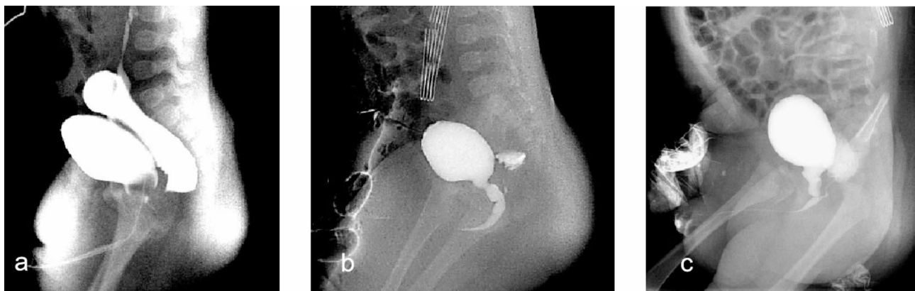
Fig. 3 Fistula diagnosed by VCUG. (a) Rectovesical fistula. (b) Rectoprostatic fistula. (c) Rectobulbar fistula

MRI is mainly used to visualize the fistula with sagittal and axial FRFSE/FSET2WI sequences, and sagittal is